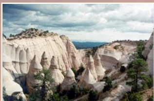
Kasha-Katuwe Tent Rocks National Monument